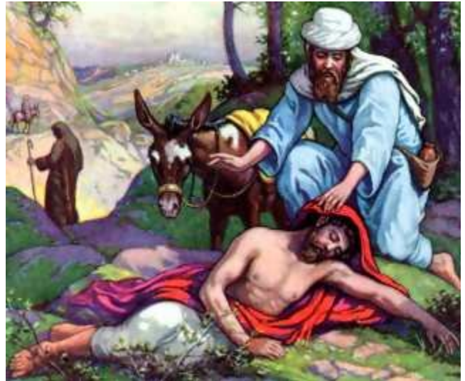
Parable of the Good Samaritan

"For God will save Zion and rebuild the cities of Judah. The descendants of His servants shall inherit it, and those who love His name shall inhabit it." (Ps 69:37)