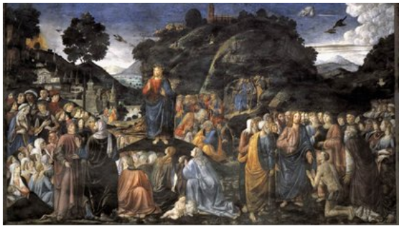
Jesus came down with the twelve and stood on a stretch of level ground with a great crowd of his disciples and a large number of the people.

"Blessed is the one who trusts in the Lord, whose hope is the Lord." (Jer 17:7-8)